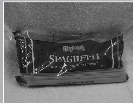
Mackenzie Michael Photos

Great source of antioxidants (some examples are vitamin C or E), lowers the risk of strokes, diabetes, bad cholesterol, different types of cancer, etc.