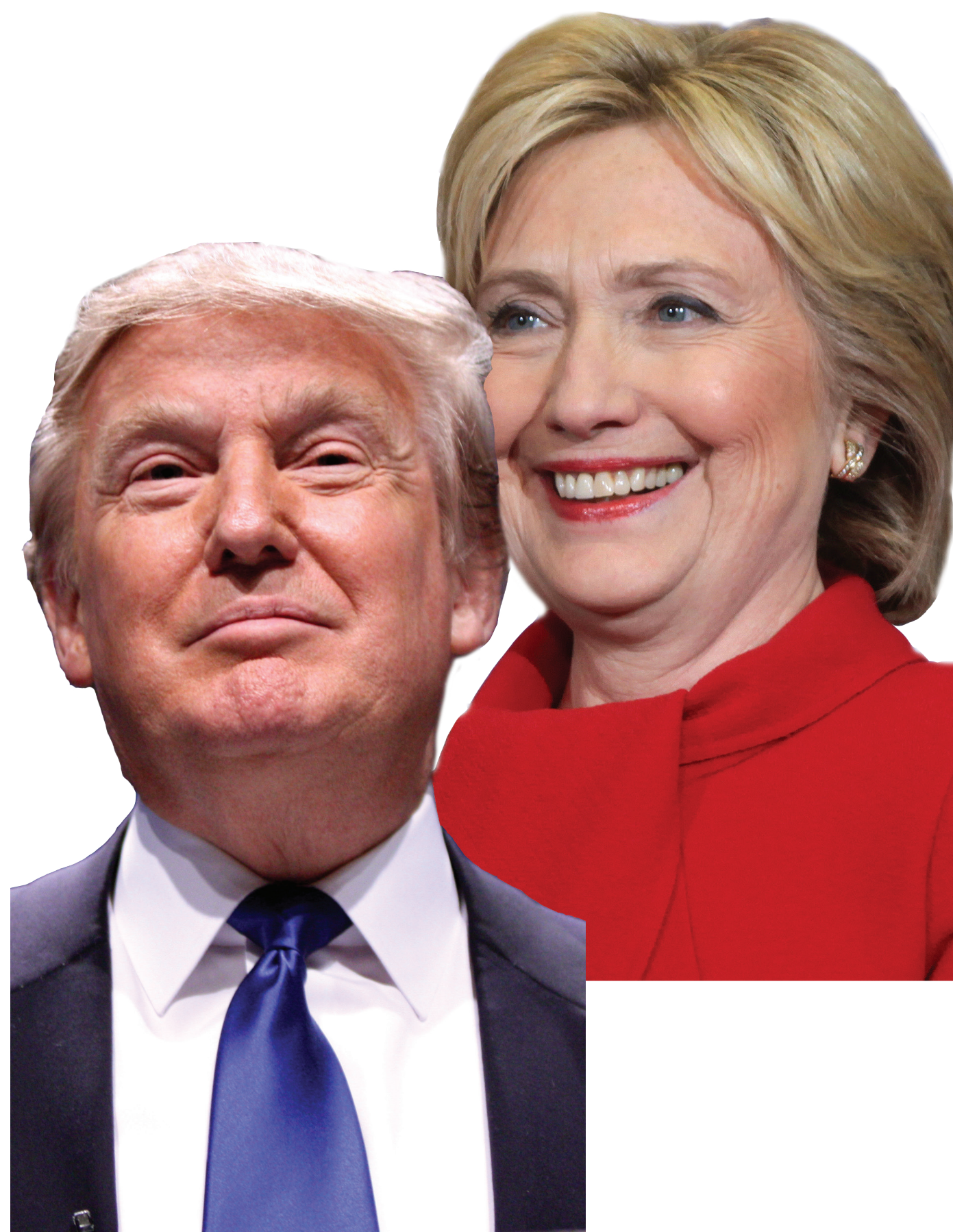
Donald Trump, the 2016 Republican candidate for the United States.