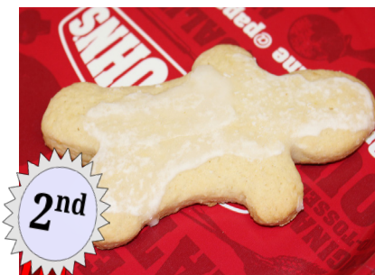
Solomon Grootuis, '18, made sugar cookies with glaze on top.