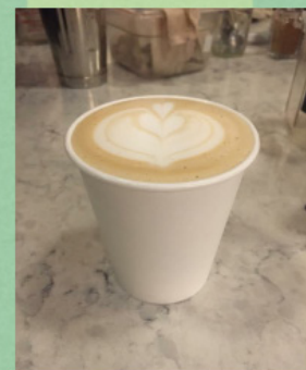
Gingerbread Latte, Brewhemia

This delicious drink tastes just like a gingerbread cookie but isn't too sweet. It would be perfect for anyone who doesn't want anything too sweet but is looking to get into the holiday spirit.