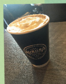
Peppermint White Mocha, Aurora Coffee

Any holiday party isn't complete without some delicious eggnog. So why not bring that party to the morning? It's a perfect blend of eggnog and coffee, making a very smooth drink with an after taste of spices.