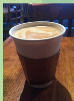
Eggnog Latte, Brewed Awakenings

This drink is red hot, literally. To add a spicy twist this mocha contains some spicy red hot candy. Great for anyone who loves hot candy and wants to warm up from the cold.