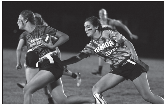
Samajda Hasic Photo