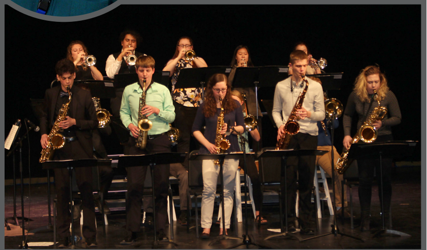
Jazz Band performs their music during CLT for the high school teachers and student body to practice their performance for their upcoming event, Night of Jazz.

If you could be any fictional character, who would you be?