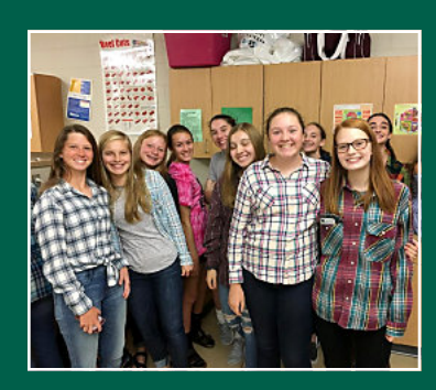
Above: Freshman girls experience a fire drill Sept. 25. The classes gathered in the family and consumer sciences room.