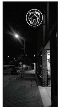
Greenhouse Kitchen, located on West 23rd in Cedar Falls

I definitely wasn't disappointed, and you won't be either.