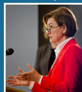
Gov. Kim Reynolds

The governor of Iowa who was responsible for the state's response to the COVID-19 pandemic. Throughout the crisis, Gov. Reynolds made decisions about closures of businesses and schools along with how to make testing available to sick Iowans.