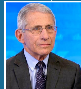
Dr. Anthony Fauci

The top infectious disease expert in the United States since 1984. Dr. Fauci provided insight to the White House Administration throughout the pandemic.