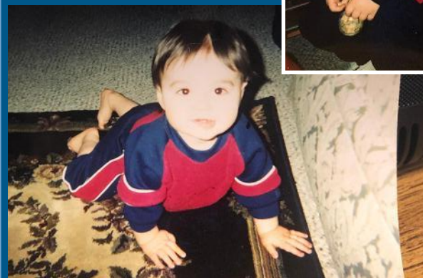
Yearbook Staff Member