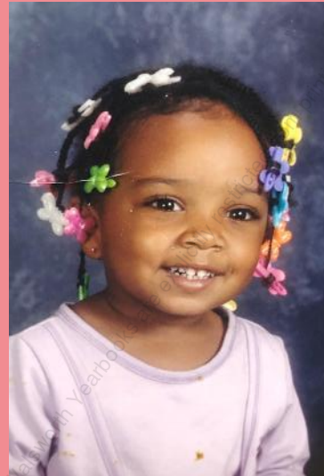
Yearbook Staff Member