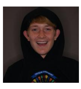
"He could totally be my twin! Don't we look like twin brothers? Basically I am just goated."