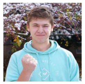
"It's literally such a legendary meme. I actually looked like him when I was a baby."