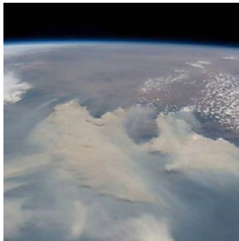
Smoke rises from fires on the east coast of Australia, taken by ISS astronauts Jan. 4, 2020. More than a billion animals were killed and more than 46 billion acres were burned in the bushfires that started in June 2019 and continued through February 2020.