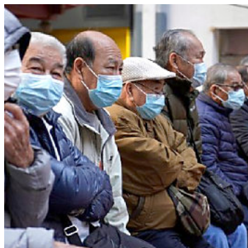
The coronavirus, or COVID-19, outbreak began in the Wuhan region of China and spread across the world. The virus is highly contagious and is easily transferrable between people.