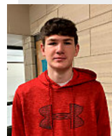
THE GIRLS VOLLEYBALL STATE CHAMPIONSHIP