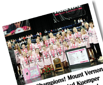
State Champions! Mount Vernon Volleyball dominated Kuemper Catholic 3-0 in the state final game on Nov. 15.