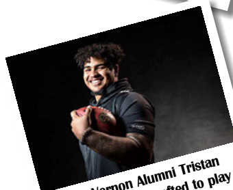
Mount Vernon Alumni Tristan Wirfs ('17) was drafted to play professional football for the Tampa Bay Buccaneers.