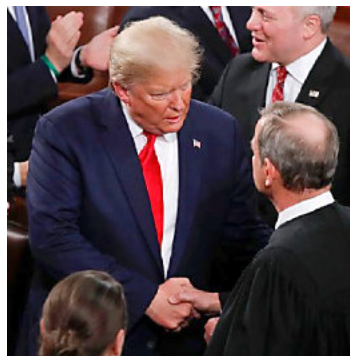
President Donald Trump was impeached on Dec. 18 for allegations of foreign interference in the presidential election. However, he was acquitted of all charges on Feb. 5.