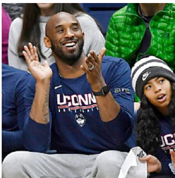
NBA Star Kobe Bryant and his daughter Gianna Bryant died in a tragic helicopter crash along with seven other passengers on Jan. 26.