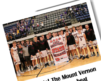
On to State! The Mount Vernon boys' basketball team beat Central DeWitt in the regional final and headed to state for the first time since 2012.