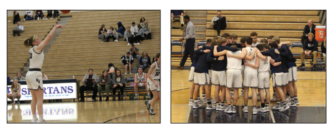
Nov. 30 and Dec. 3: Spartans get first wins: Both the boys and girls basketball teams got their first wins of the season against Burlington and Linn-Mar respectively.