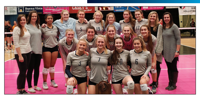
Nov. 12-14: Volleyball trip to state The Spartans lost in the state semi-final, and ended their season with a 30-6 record.