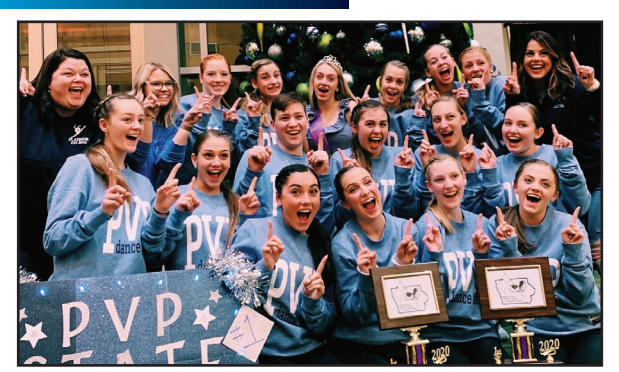
Dec 6: Platinum wins first place at state meet PV Platinum was all smiles after claiming first place trophies in both jazz and pom at the state dance meet.