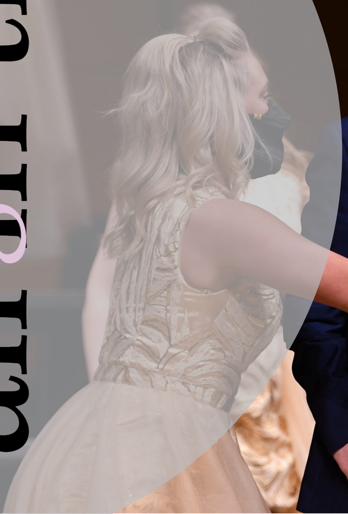
caption by: Rylan Shultes design by: Madison Layman