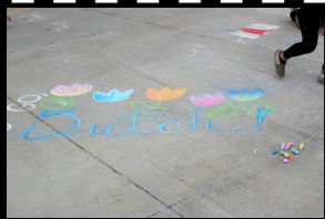
● Freshman Elaine Babcock draws "Dutch" with tulips in chalk during class competitions.