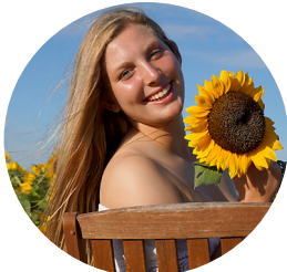
EDITOR IN CHIEF

"Working with such an amazing group of editors and staff members made this year very memorable as an Editor in Chief. I love having the ability to create a book that will hold each student's memories which they will be able to cherish for a lifetime."