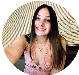
EDITOR IN CHIEF

"Being Editor in Chief means everything to me. Ever since I joined Yearbook my sophomore year, this is what I've dreamed of. Having my thoughts matter and be transferred into something real is an amazing experience to have. I wouldn't have wanted a better team this year."