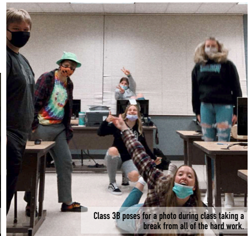
Class 3B poses for a photo during class taking a break from all of the hard work.