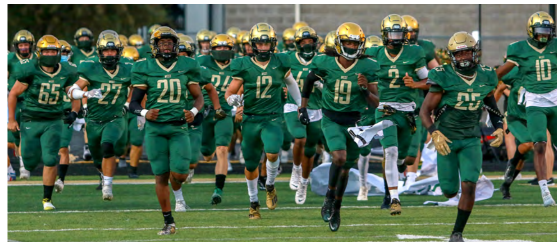
STORM THE FIELD The football team rushes through the banner onto the field for the Battle for the Boot without a single fan in the stands. West High set a new school record in winning their fourth consecutive Boot game Sept. 4.