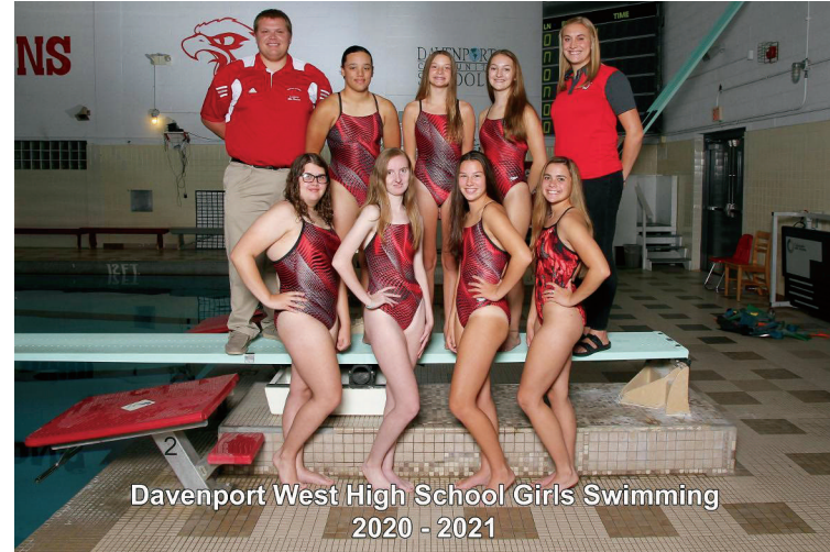
Davenport West High School Girls Swimming 2020 - 2021