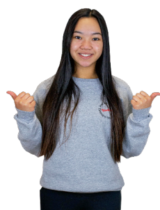
Mai La 38/37, 42/43, 66/67, 82/83, 96/97, 100/101, 152/153