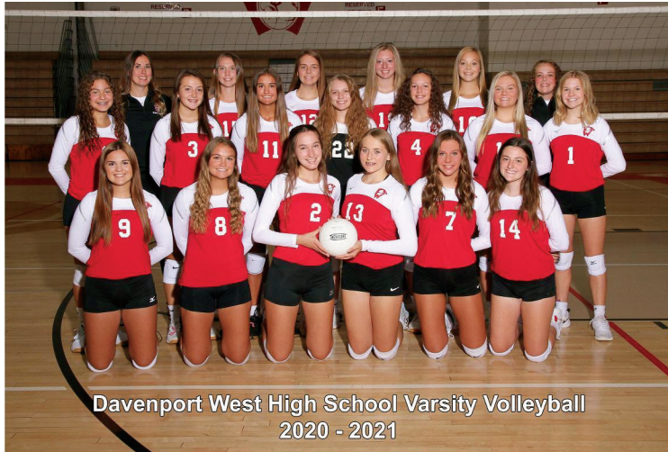
Davenport West High School Varsity Volleyball 2020 - 2021