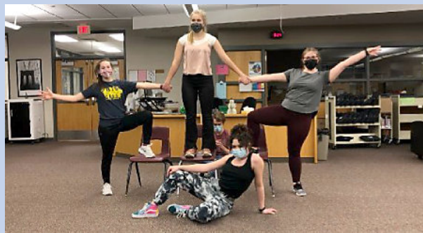
Trying to get their voices heard, the Suessical musical theater group rehearses a scene from the musical during rehearsal.