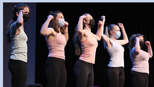
Striking a manly pose, the Manly Men musical theater group performs at Pops Show May 15.