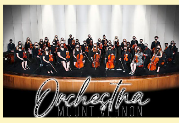
Orchestra Layout by Julissa Govea 101