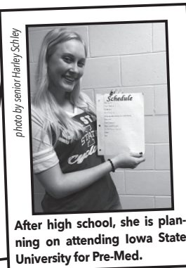
After high school, she is planning on attending Iowa State University for Pre-Med.