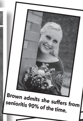
Brown admits she suffers from senioritis 90% of the time.