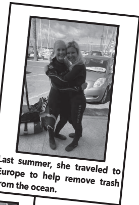
Last summer, she traveled to Europe to help remove trash from the ocean.