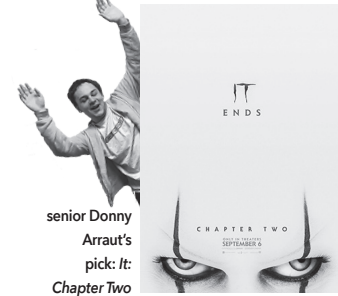
senior Donny Arraut's pick: It: Chapter Two