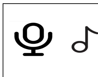
Music vs. Podcasts

62% Public University 23% Private University