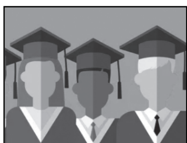
Public vs. Private University

62% Public University 23% Private University