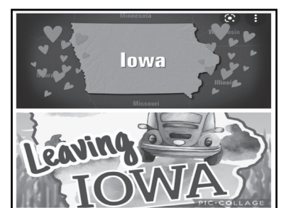
Stay in Iowa vs. Leave