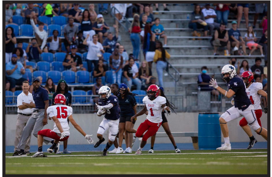
On the move! Roosevelt coaches follow their players in the game against East on Friday, August 27th. The coaches must be able to follow and focus on each play in order to decide what the next move is.

"I have ties to Des Moines being friends that I met at Iowa State, my