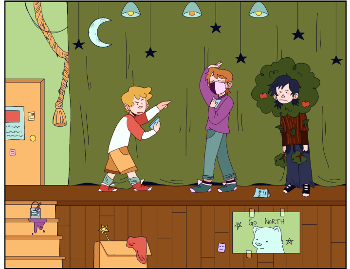
Answers on dmnorthmedia.com