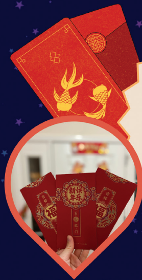
Katelyn Chen '25

It is tradition for parents to give their children money in red envelopes, wishing them good health and studies. The vibrant red color also symbolizes good luck and blessings for the year ahead.