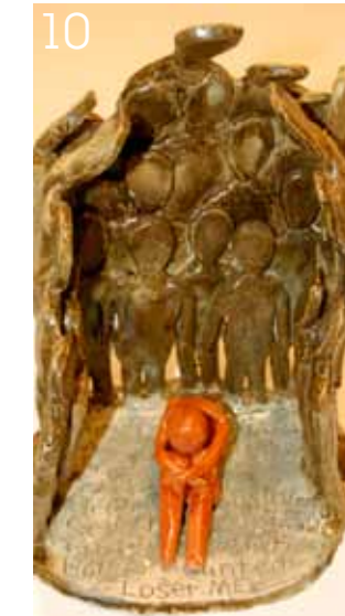
CORINNE WARHNE '16