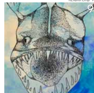
LIBBY LANGER '15