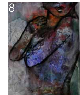
KATE GYLTEN '15