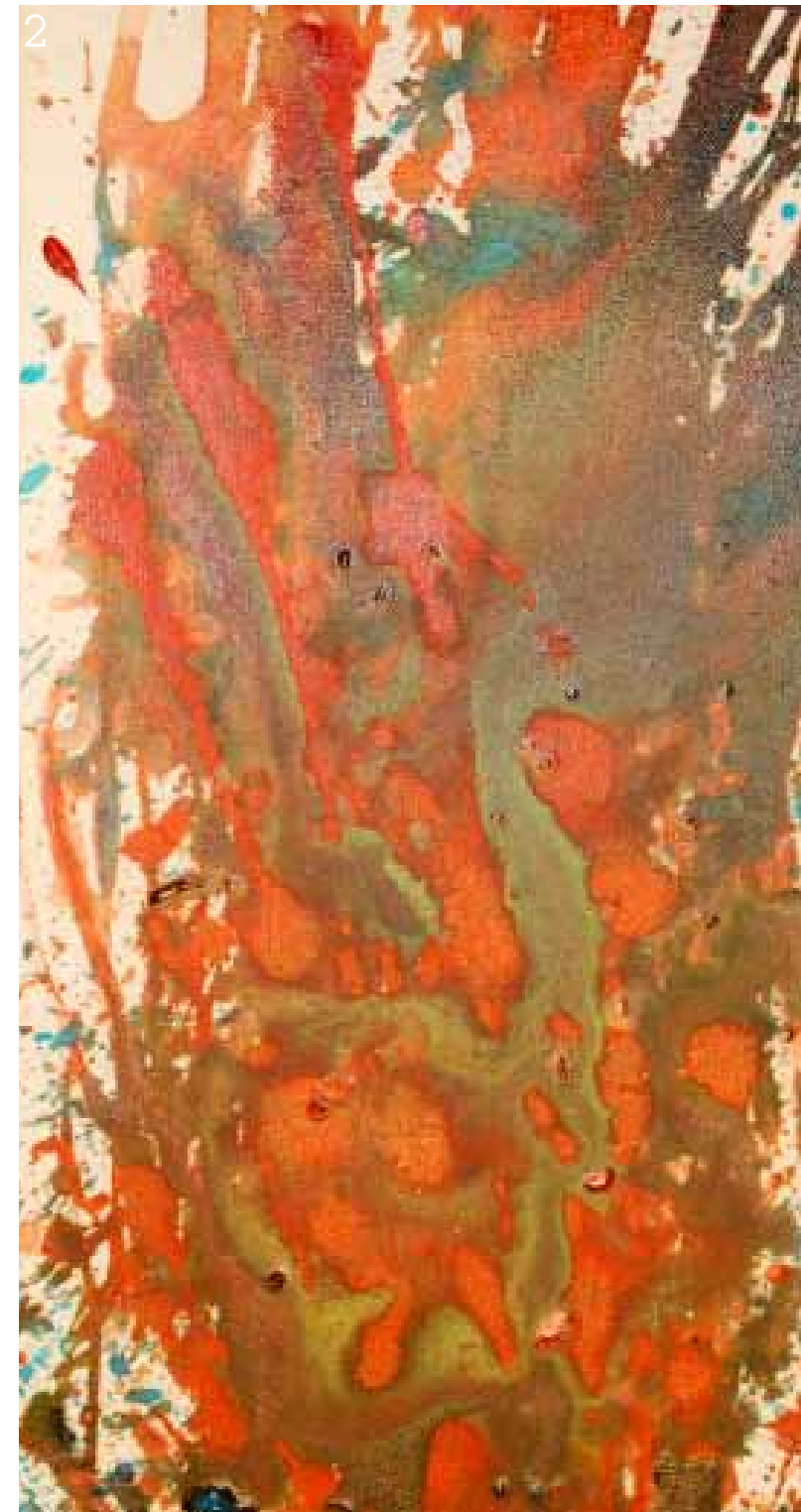
CORINNE WARHNE '16