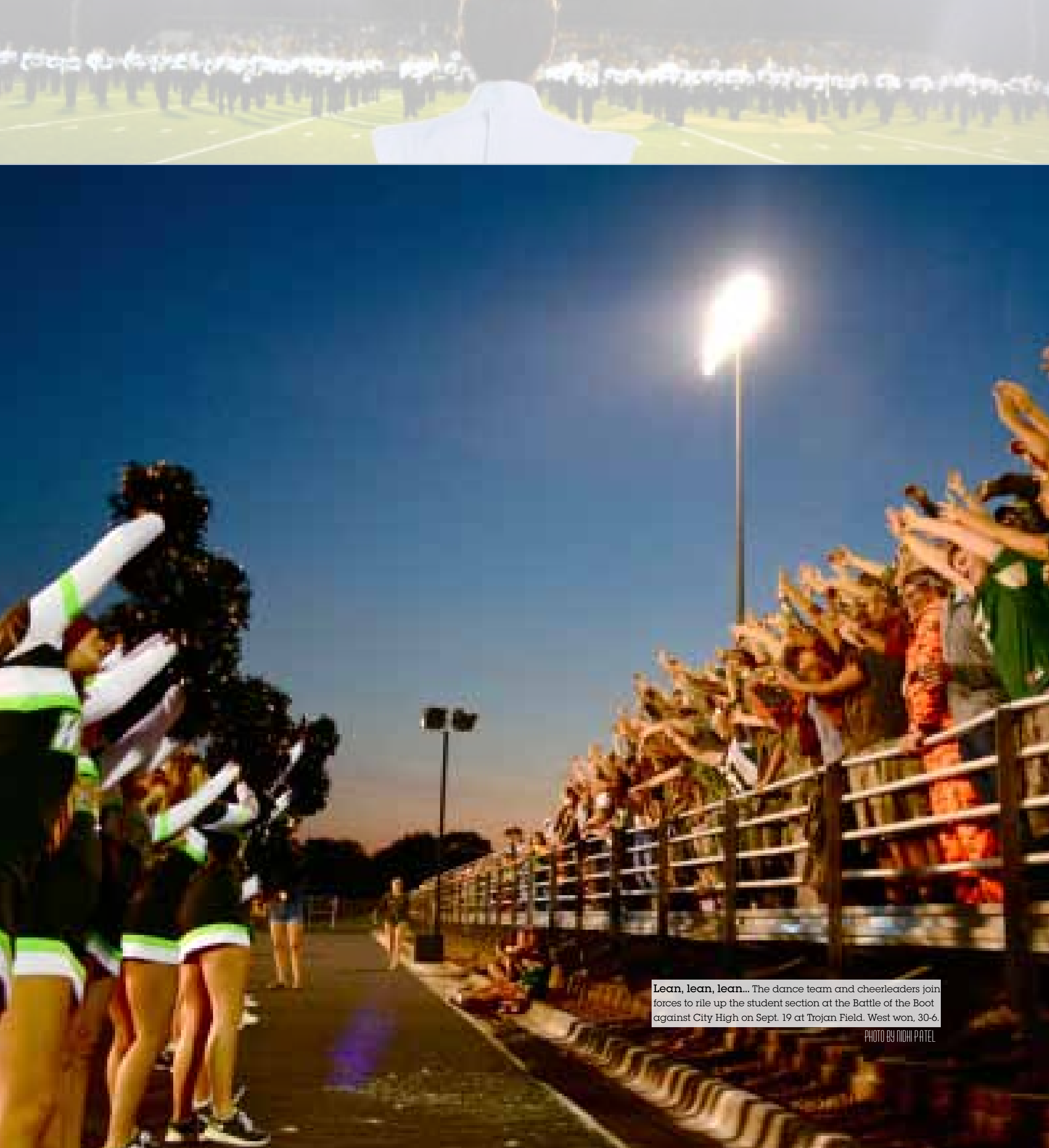
Lean, lean, lean... The dance team and cheerleaders join forces to rile up the student section at the Battle of the Boot against City High on Sept. 19 at Trojan Field. West won, 30-6.

Spec. Instr. _____ PFS Date: Sat Nov 1 2014 10:06:25 AM