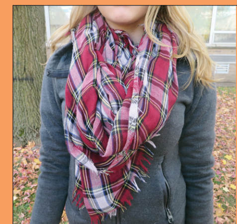
Popular fall colors include reds, grays, browns and blacks. You can commonly find in flannel shirts and scarves.

Every year Ugg boots have been the most popular winter shoe for girls. Lately they have been worn with sweater socks that go up to about your calf and will keep you warm for the whole winter.