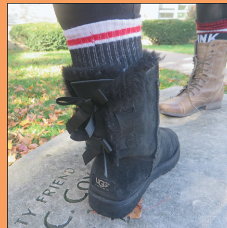
Bailey Bow Ugg boots and Combat boots are the latest fall and winter fashion for shoes. To go with these stylish boots you can also accessorize with boot socks.

Not only are the plain hoodie sweatshirts popular but so are the half zip ones and hoodless sweatshirts. Mackenzie believes that North Face is probably the most popular brand during this time, and that deals are better during the fall and winter times. North Face products can range from $100 to $175. So now is the time to do your holiday shopping if you want to get the hottest clothes.