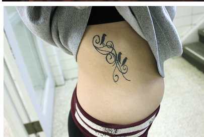
BIRDS ON A CAGE. Showing off her unique tattoo on her ribcage of birds is Serena Carter (’16).