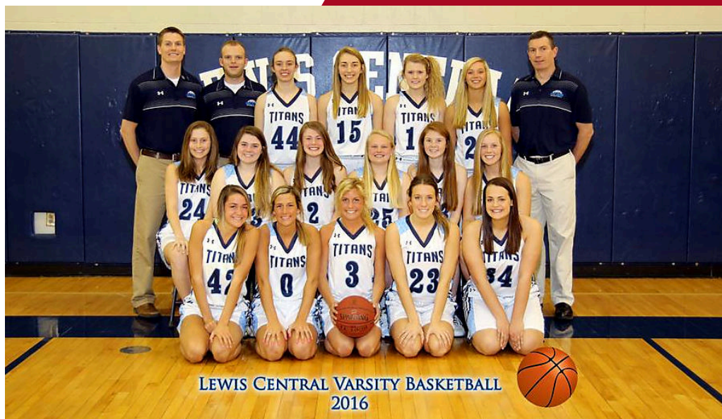
LEWIS CENTRAL VARSITY BASKETBALL 2016