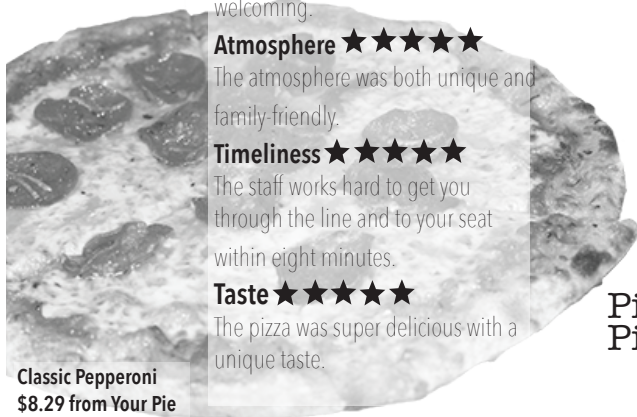
Classic Pepperoni $8.29 from Your Pie

Woodfire ovens cook the pizza at a high temperature (500°-700°) for a very short time (1-5 minutes).