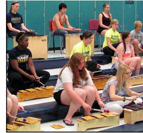
Playing an Orff Ensemble in Musical Mania, these future musicians learn how to play in harmony.