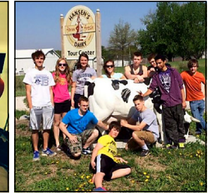
The Healthy Lifestyle crew went on a field trip to Hansen's Farm Fresh Dairy Farm where they took a tour of the facilities.