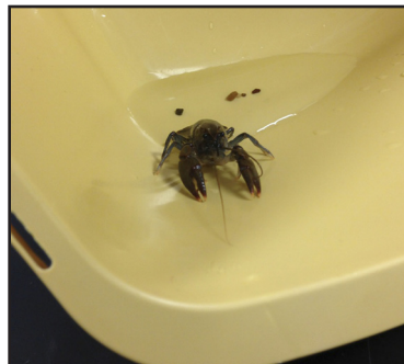
A crayfish poses for the camera.