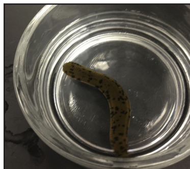
A leech in its natural state. 12→SEPTEMBER