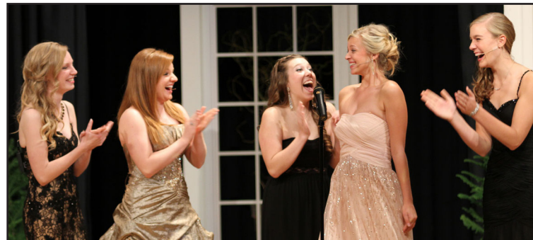
2014 Tulip Court