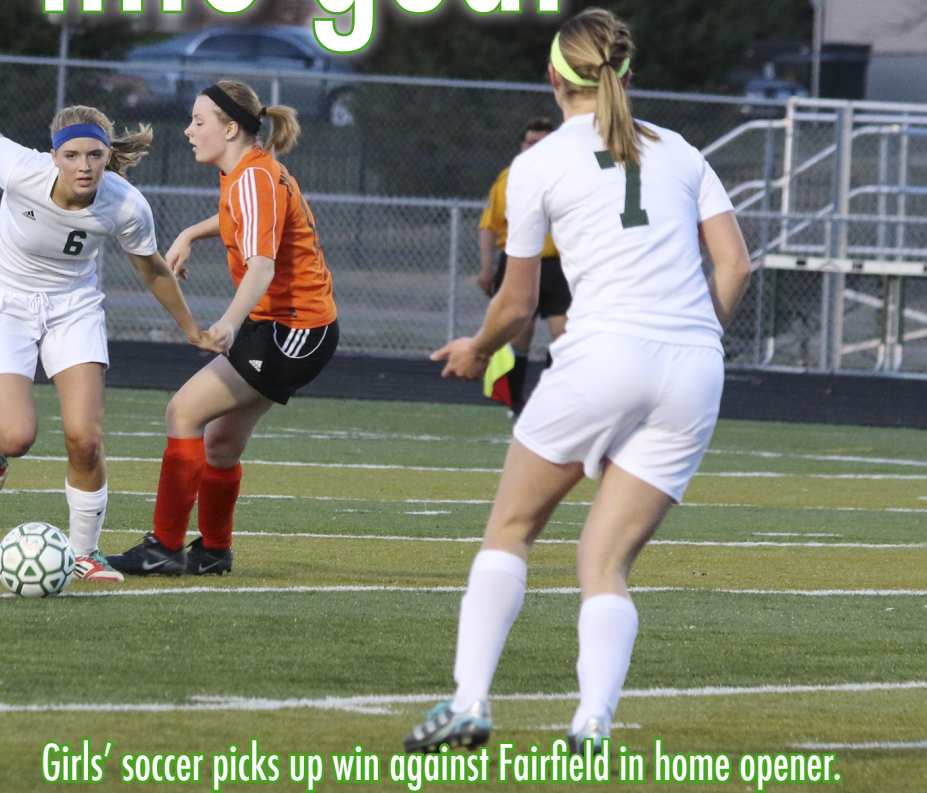
Girls' soccer picks up win against Fairfield in home opener.

"The season has started very well. We lost eight seniors from last year, so we are learning to adjust to different playing styles."