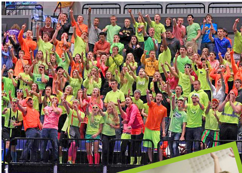
1. The neon student section enthusiastically cheers, "We got spirit! Yes, we do! We got spirit! How about you?" across the volleyball court to the Kuemper Catholic student section on Nov. 14. The Mount Vernon volleyball team lost to the Knights in 3 sets.