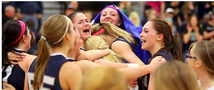
The team celebrates after a victory against the Stanton Viqueens. Winning the game advanced them to state.