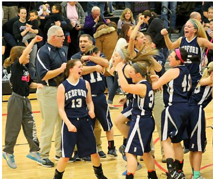
The team celebrates after winning the regional final game against Stanton. They defeated the Viqueens with the score 56-51.