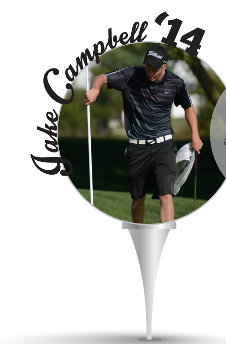
"I hated missing school for golf. I'd try to get ahead and then I would go to a golf meet and be behind again."